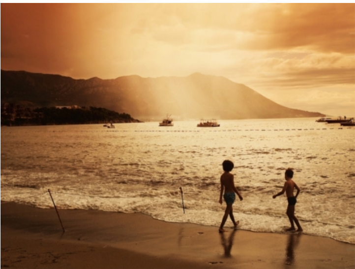
When Words Aren't Necessary