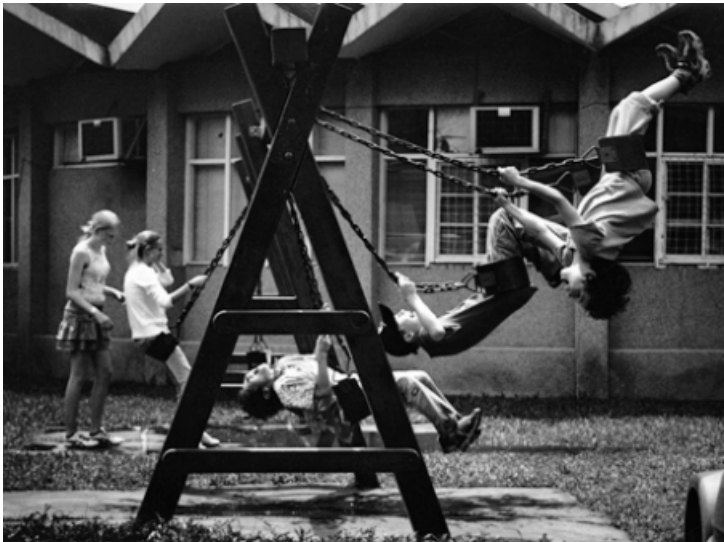
How People Learn: An Evidence-Based Approach