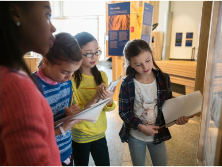
Judgment: Navigating Choices and Decisions